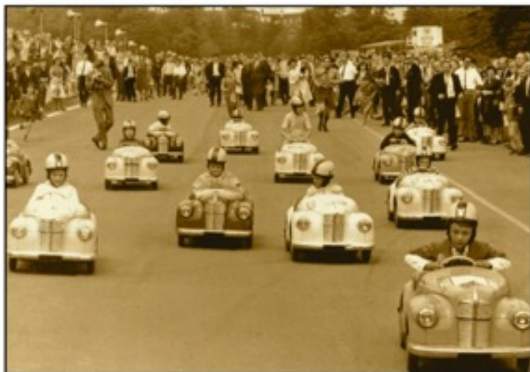
Future Indie drivers--1955