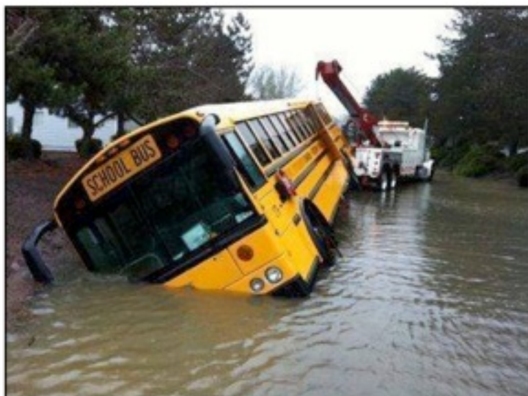
Italian Cruise ship captain Francesco Schettino began his new job yesterday as a bus driver...