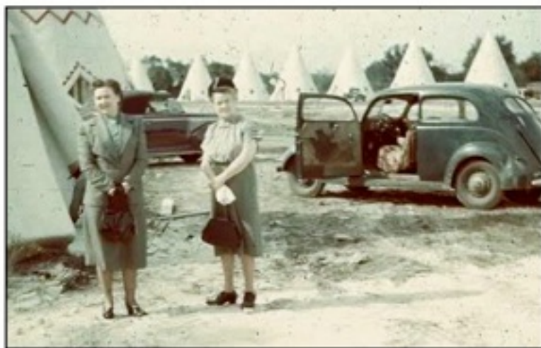
Above: 4 Star Ford Vacations - Arizona 1949

The Early Ford V-8 Club National Directors will be gathering in San Diego February 22-23 for their annual face-to-face Board meeting hosted this year by the San Diego Regional Group. The two-day board meeting, open to V-8 Club members, will be held at the Best Western Seven Seas Motel in Mission Valley. Directors will meet all day Wednesday, February 22 and most of the day on Thursday, February 23. Directors have been invited to stay over in order to attend the Big Three Parts Exchange on Friday and Saturday.